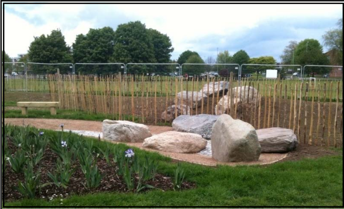
Play Area under construction in May

Brickhill has a new natural play area on Waveney Green designed especially for children aged 8 - 13 yrs. The site and the equipment were chosen after consultation with the community of Brickhill. The area has been funded using money from the Government's Playbuilder Scheme and is intended to encourage children to enjoy imaginative, challenging and stimulating play.